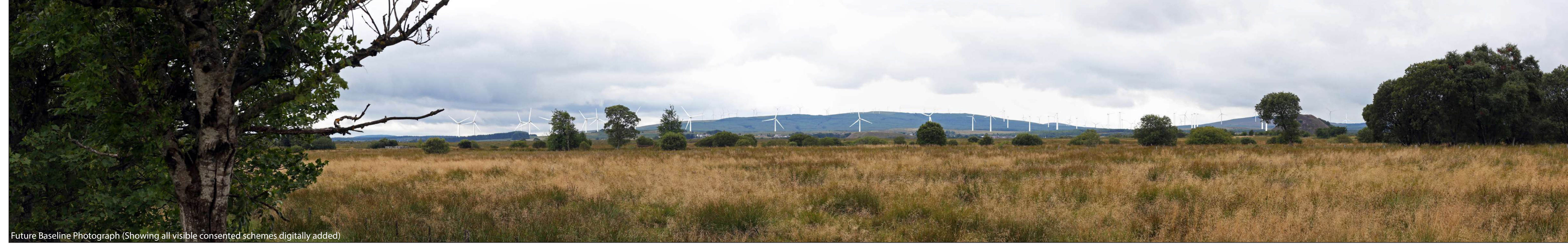
Figure 6.35 (sheet A) Viewpoint 4: B7078 south of Lesmahagow DOUGLAS WEST WIND FARM EXTENSION