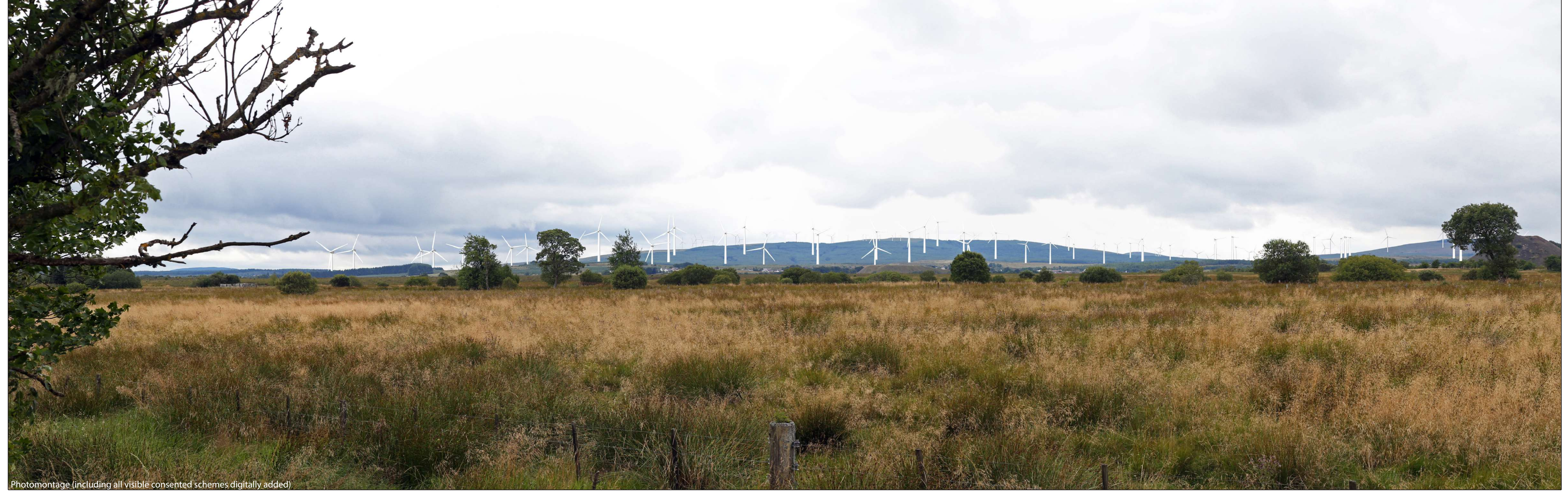
Figure 6.35 (sheet D) Viewpoint 4: B7078 south of Lesmahagow DOUGLAS WEST WIND FARM EXTENSION